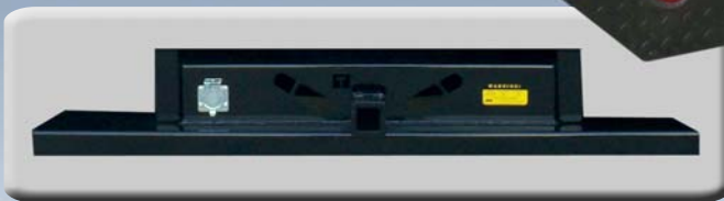
10,000# Receiver Hitch / ICC Bumper